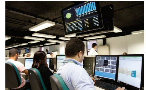
Equinix RJ1 security and maintenance