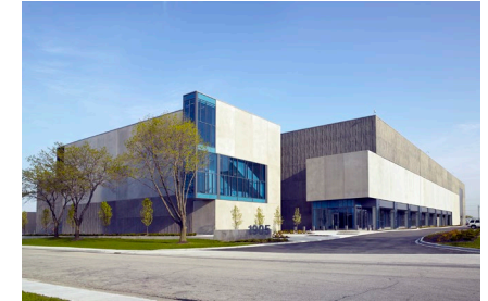
Equinix CH3 IBX data center exterior