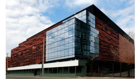
Equinix TR2 IBX data center exterior