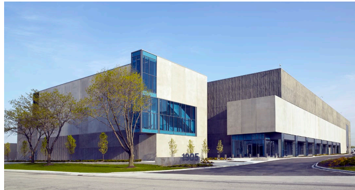
Equinix CH3 IBX data center exterior

To learn more about interconnection opportunities in Chicago, visit the Explorer feature within Equinix Marketplace .